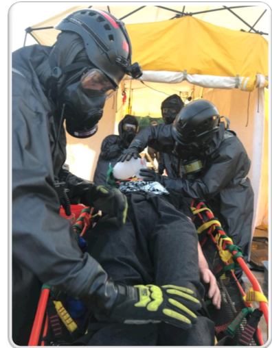
Pictured: The National Guard troops are working on medical treatment of a contaminated victim.

The US Army North evaluated the South Carolina National Guard at NIPSTA from July 19-29. Over this 10-day period, members of the US Army were assessed in all Technical Rescue Training disciplines such as vehicle and machinery, confined space, trench, collapse and rope. Trainees donned full HAZMAT isolation suits with respiratory protection, to meet specific standards (i.e. operating at night, readiness as a weapons of mass destruction rescue group). They were responsible for setting up their own camp daily and often worked until well past midnight. Over 100 people were on site each day. This yearly evaluation is required to maintain status as a rescue group. While this was their first time at NIPSTA, we hope they return next July. NIPSTA's TRT staff, administered by Ken Koerber and Jered Milton, was on site every day to assist with support logistics, equipment operation and overall site safety.