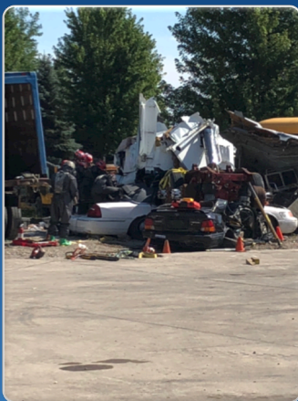
Left: The National Guard is working on a vehicle extrication and stabilization scenario. Right: The view from the outside of the medical treatment/decontamination (decon) zone.